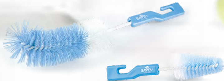
BBA 6405 Bottle and nipple brush