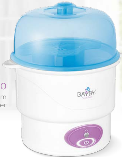
BBS 3010 Electric Steam Sterilizer