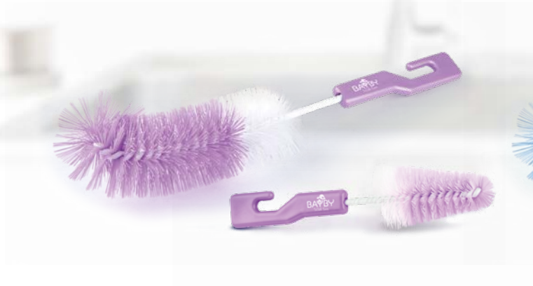
BBA 6404 Bottle and nipple brush