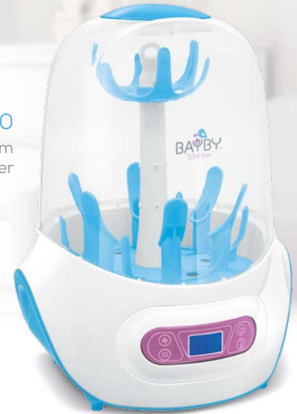
BBS 3030 Digital Steam Sterilizer with Dryer