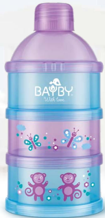
BBA 6409 Milk Powder Container