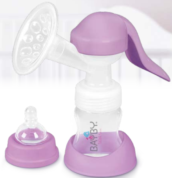
BBP 1000 Two-Phase Manual Breast Pump