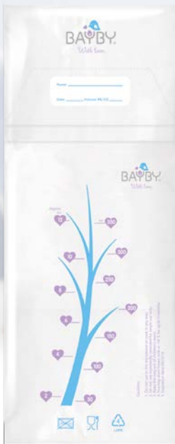
BBS 6000 Breast Milk Storage Bags 30 pcs