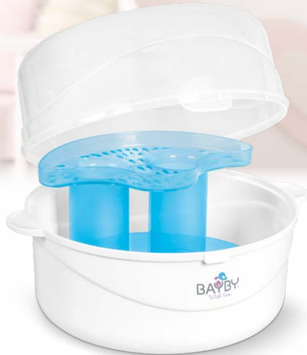
BBS 3000 Microwave Steam Sterilizer