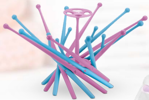
BDR 5000 Baby Bottle Drying Rack